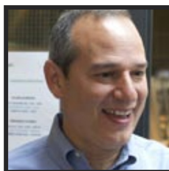
Executive Committee members pictured above from top: