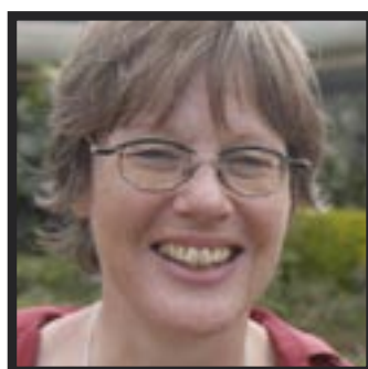
Executive Committee members pictured above from top: