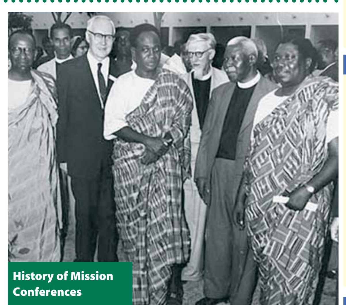
The sixth world mission conference met in Achimota near Accra, Ghana.

The sixth mission conference in Achimota debated a proposal to unite with the World Council of Churches, with which it shared several programmes and entertained intensive relations. The proposal was accepted by a great majority, while certain more conservative mission councils refused to integrate mission and church. They wanted to preserve missionary freedom, and not become dependent on ecclesiastical authorities and agendas.