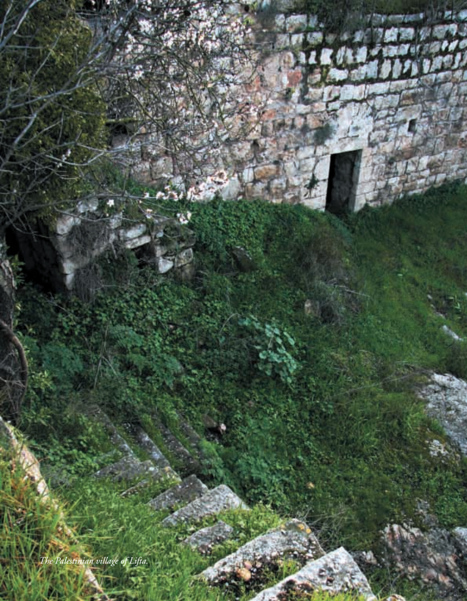
The Palestinian village of Liffa.