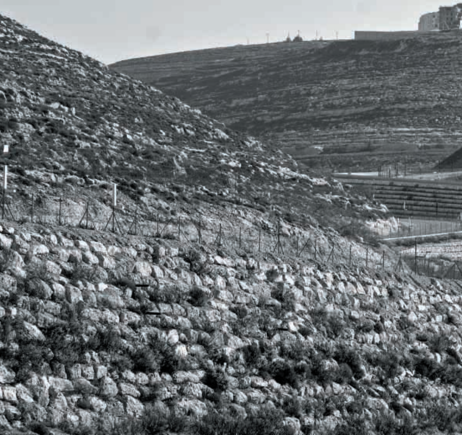
The winding Separation Wall close to At Tira village. Palestinians are prohibited from using the military patrol road.