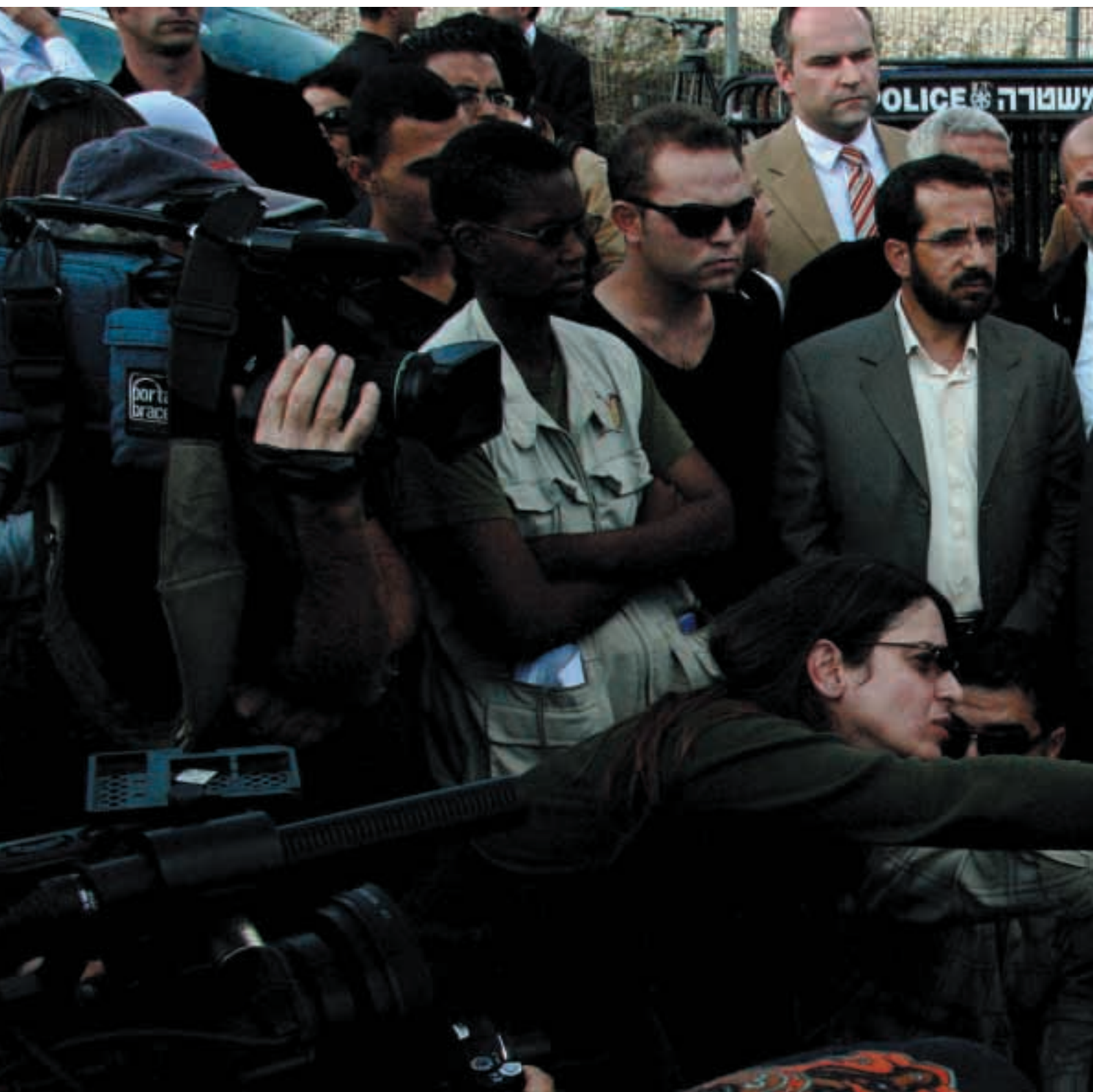
Press conference after the Al Kurd family was evicted from its home in the East Jerusalem neighbourhood of Sheikh Jarrah in November 2008.