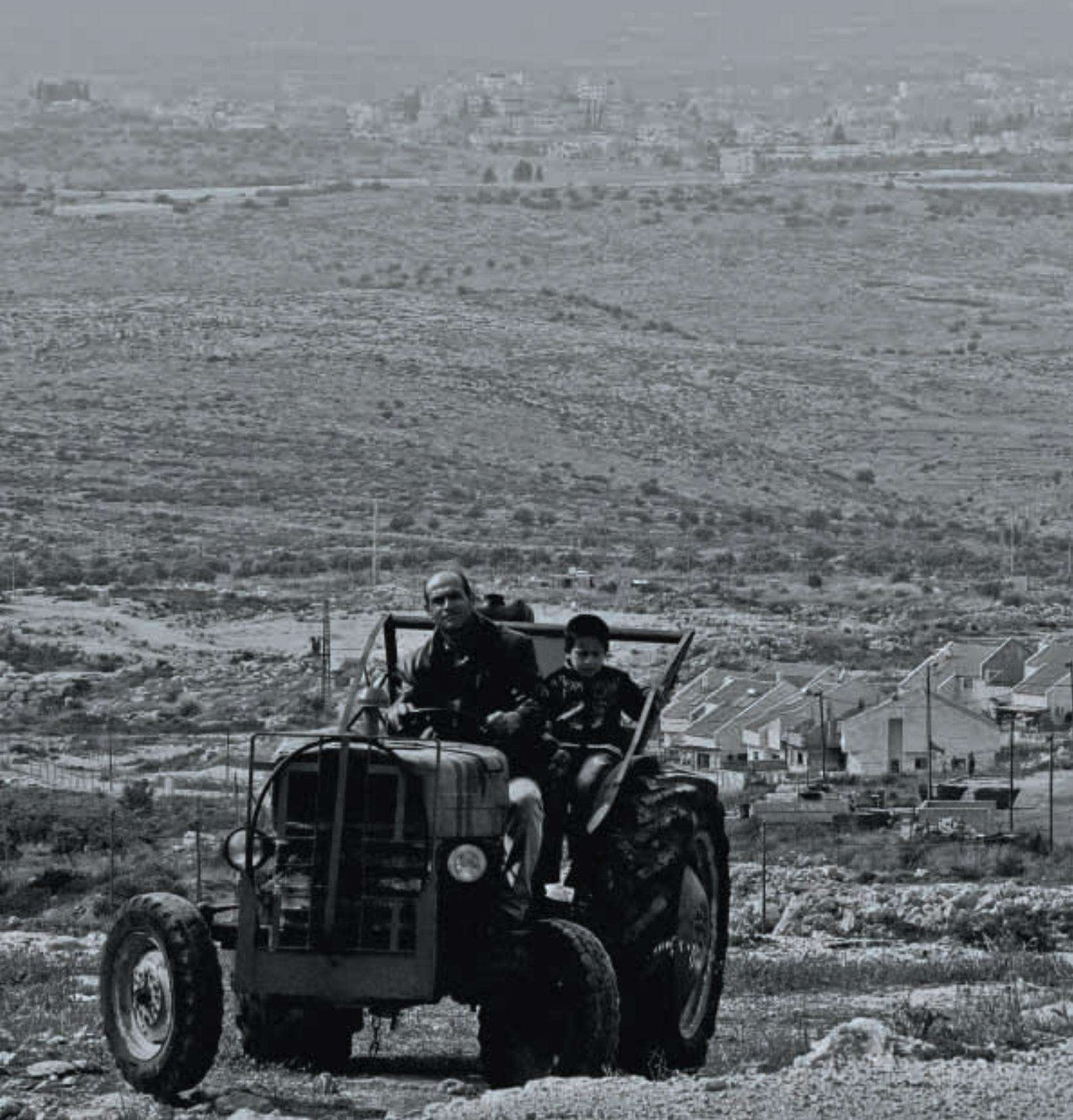
A farmer on his way home to Shufa with an Israeli settlement in the background.