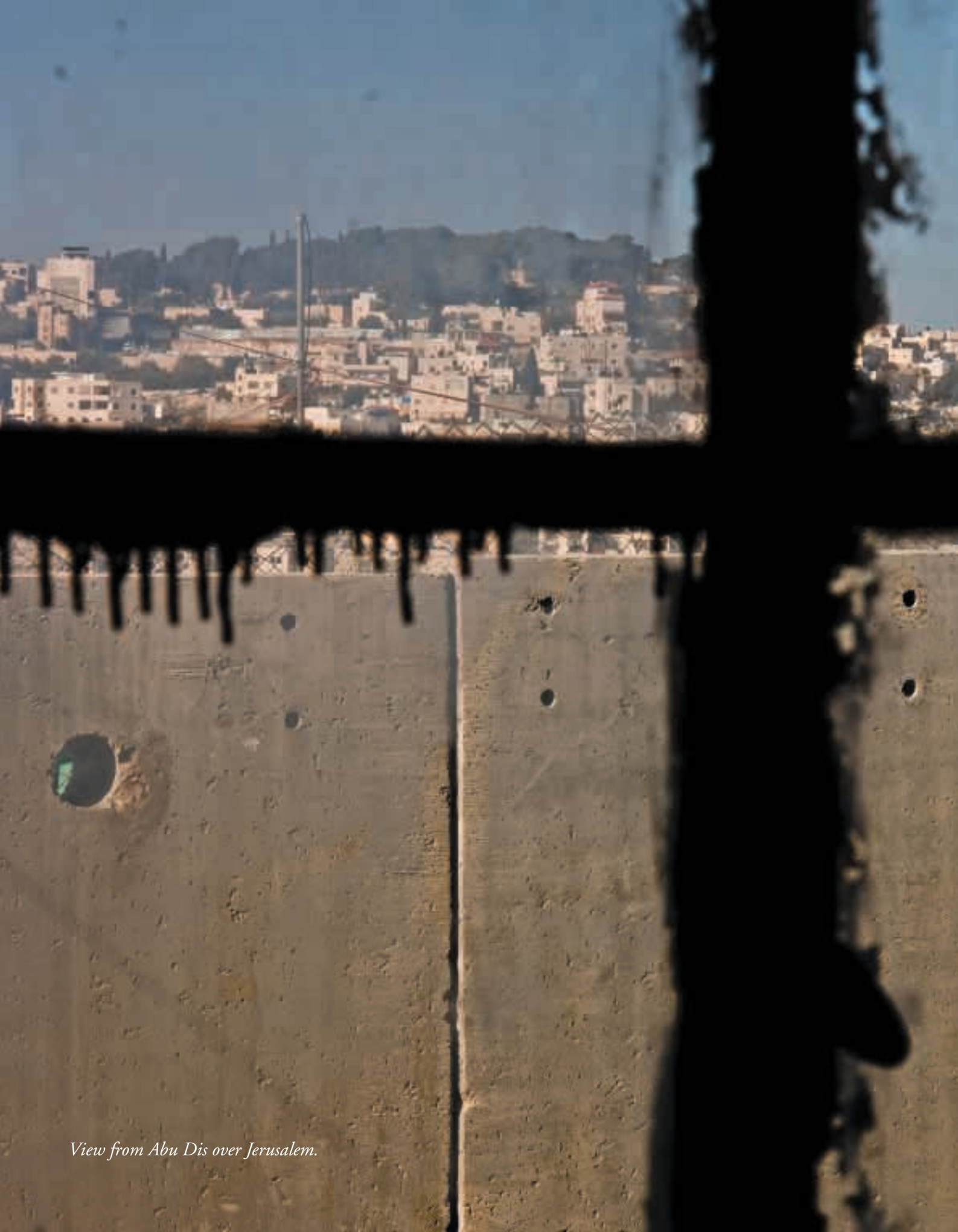
View from Abu Dis over Jerusalem.