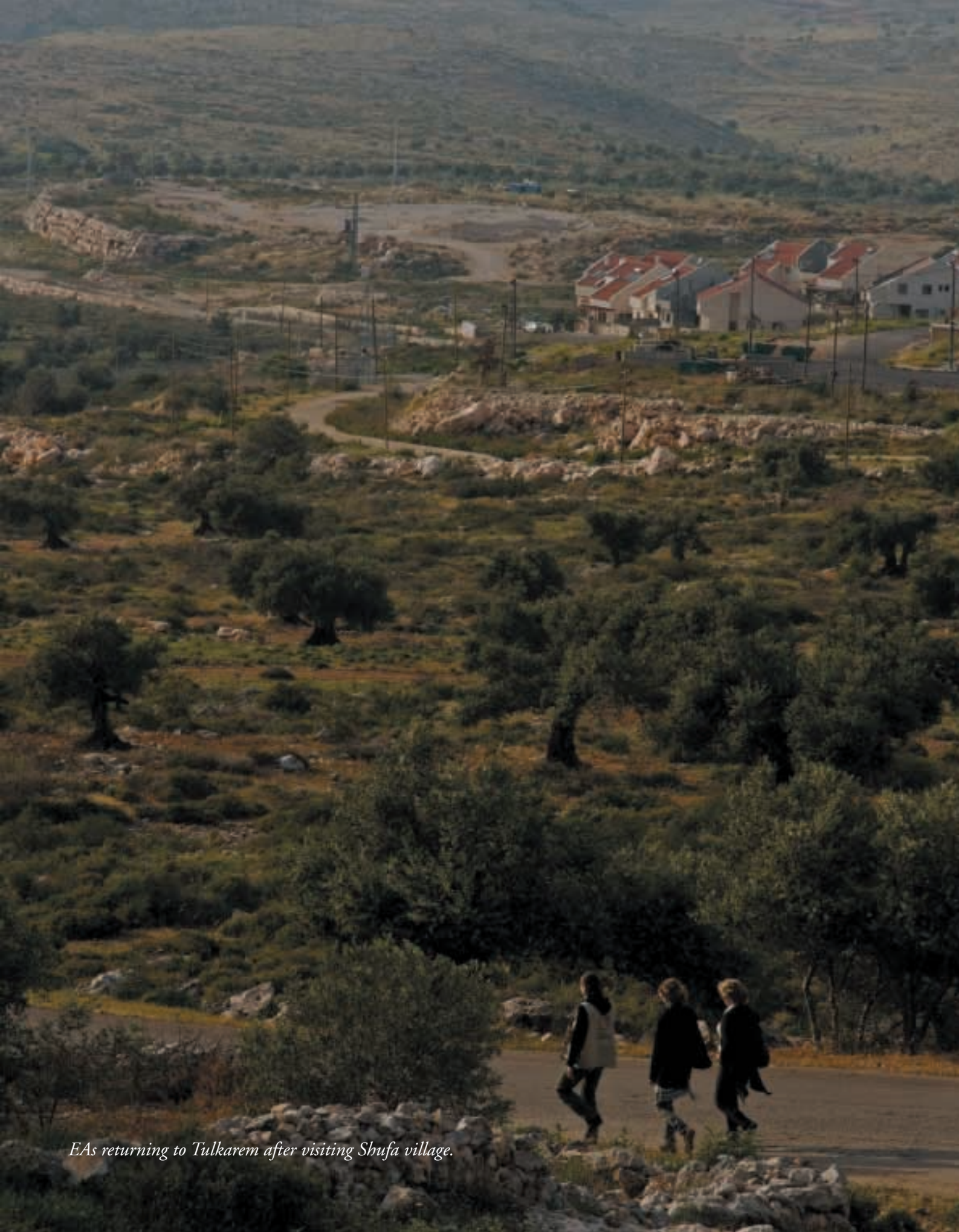
EAs returning to Tulkarem after visiting Shufa village.