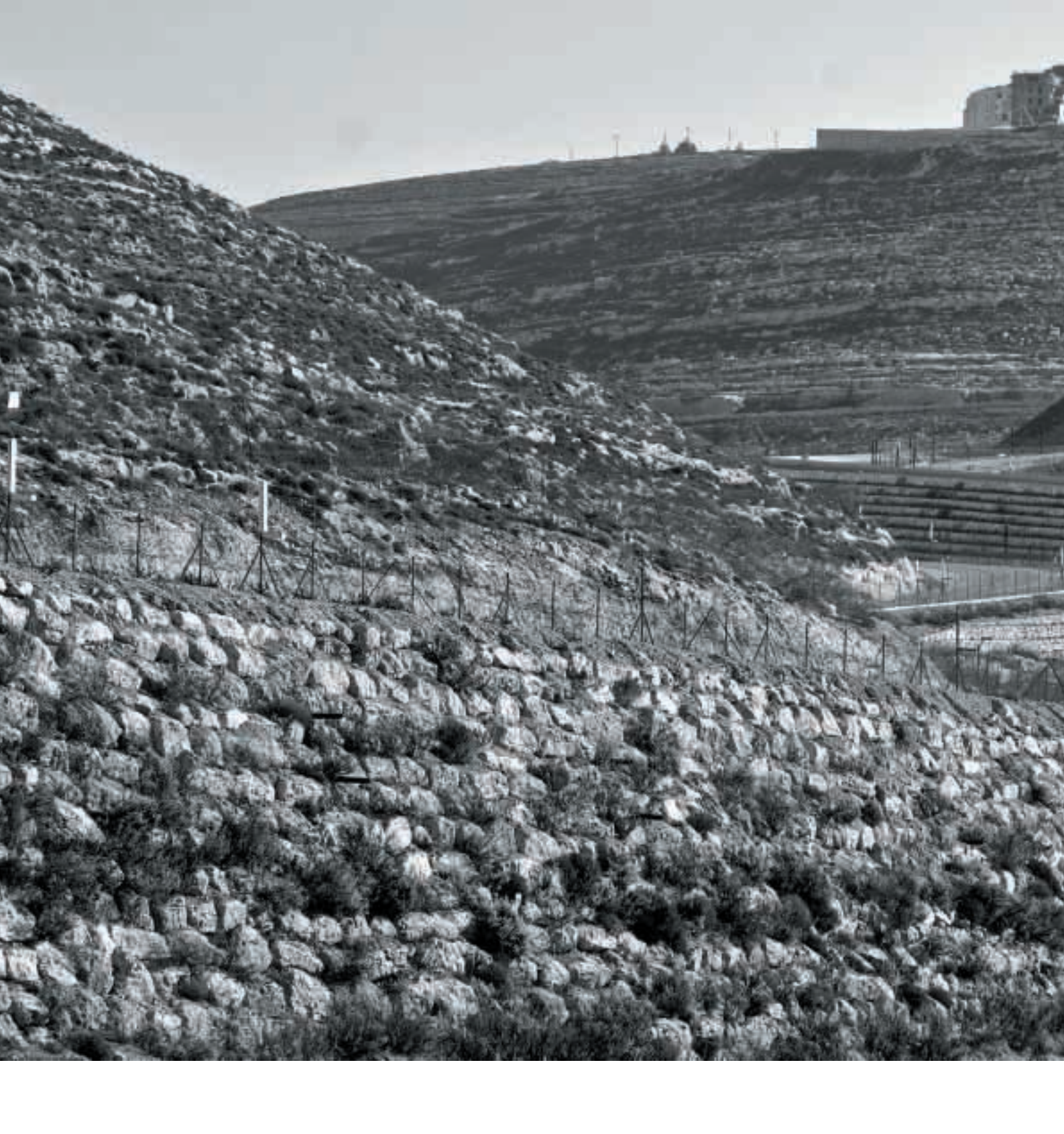
The winding Separation Wall close to At Tira village. Palestinians are prohibited from using the military patrol road.