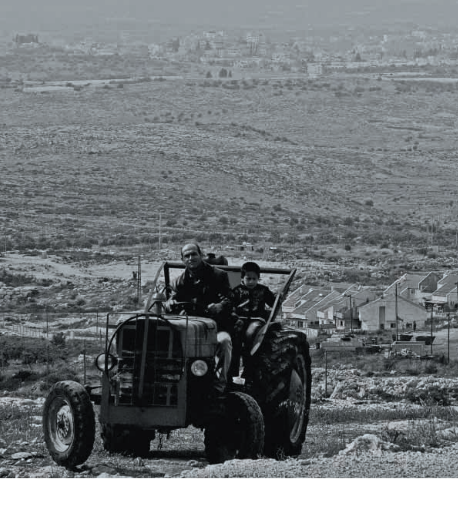
A farmer on his way home to Shufa with an Israeli settlement in the background.