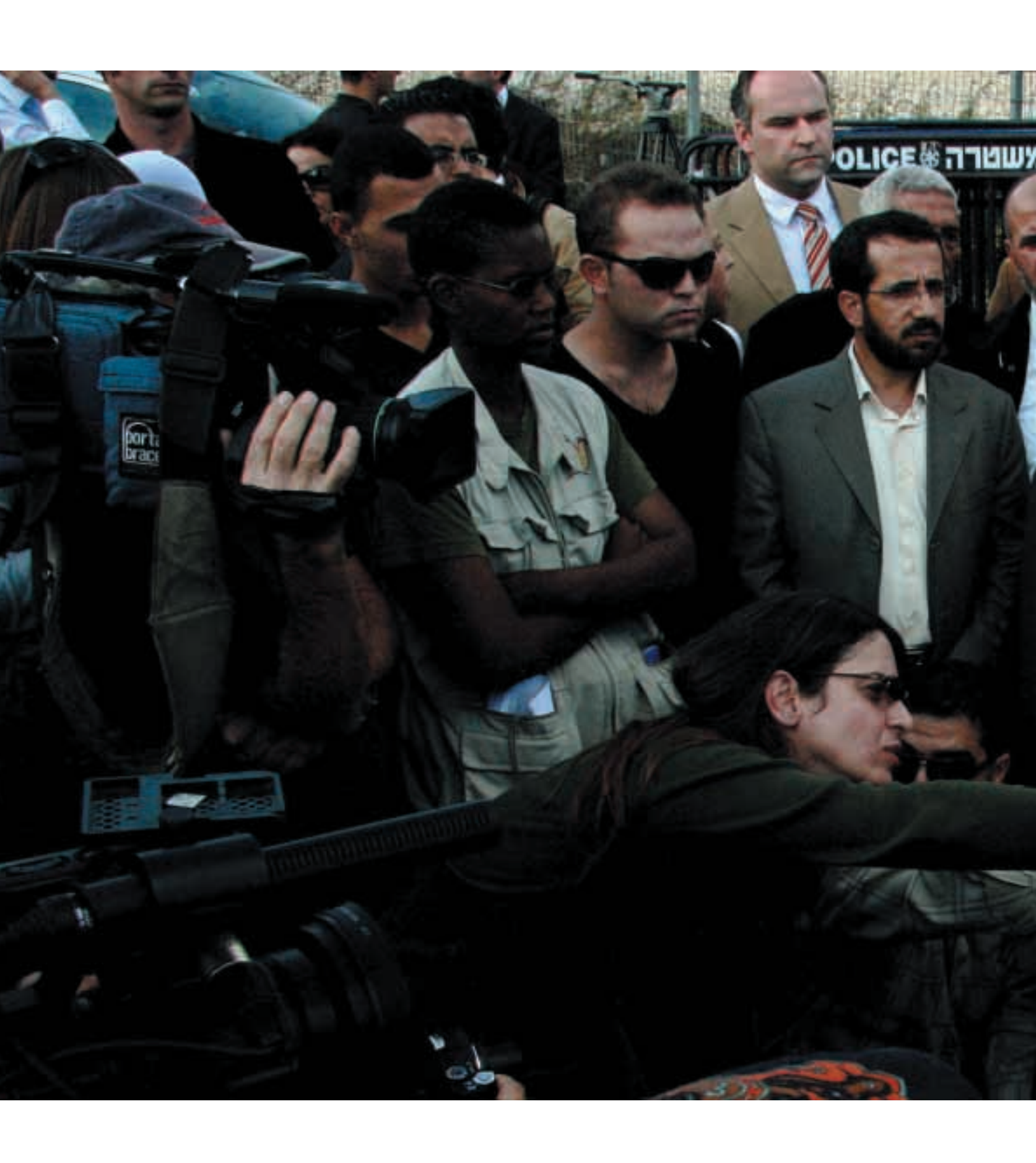
Press conference after the Al Kurd family was evicted from its home in the East Jerusalem neighbourhood of Sheikh Jarrah in November 2008.