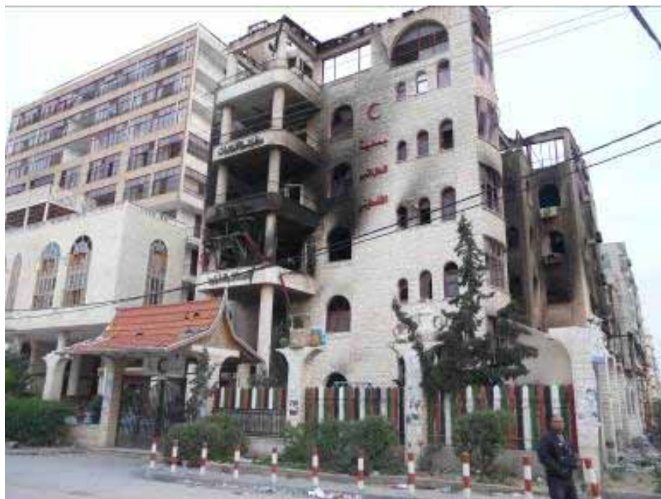
Al-Quds hospital

By the afternoon the hospital managed to arrange for co-ordination, via the ICRC, to evacuate the hundreds of civilians who had taken refuge in the hospital to an emergency UNRWA shelter. Meanwhile, hospital staff battled the localized fires which kept reigniting. In the evening, when more white phosphorus hit the hospital, the staff were forced to leave, taking the patients out in their beds and pushing the beds along the road away from the building. The patients were eventually transferred to al-Shifa hospital. A medicine store, in a small separate building around the corner from the hospital, was burned to the ground, seemingly having likewise been struck by white phosphorus. Two ambulances were burned and crushed near the hospital.