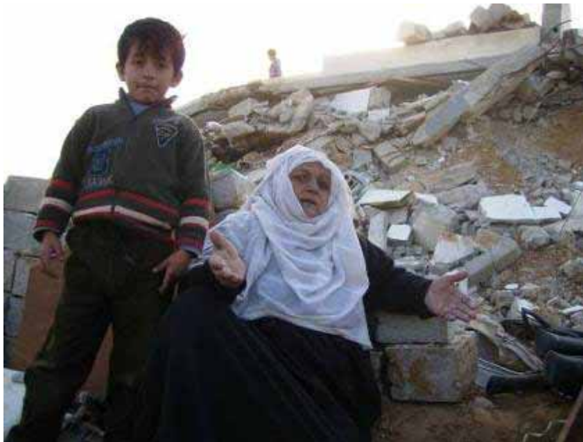
Homeless after the destruction

More than 3,000 homes and hundreds of other properties, including factories, workshops, animal farms and orchards, as well as government buildings, police stations and prisons, were destroyed and more than 20,000 were damaged during Operation “Cast Lead”. 88 The Israeli authorities’ explanation for such devastation was “military/security necessity”.