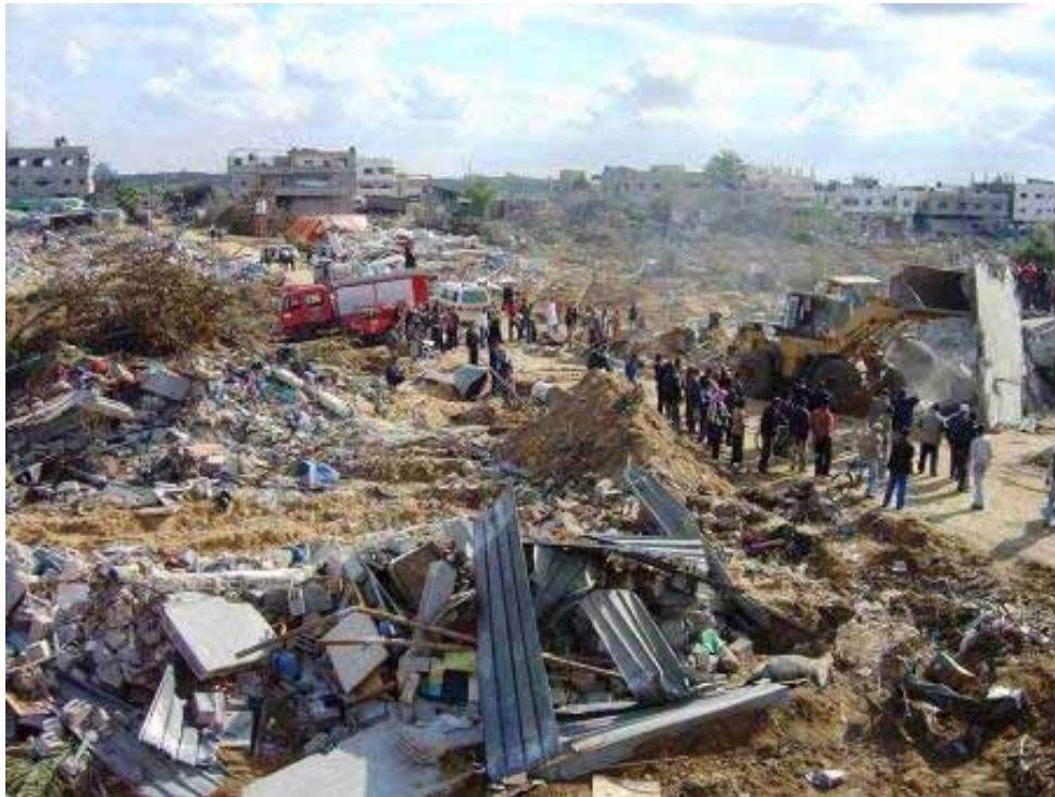
Bodies of members of the al-Sammouni family being retrieved on 18 January 2009

One of the most shocking cases is that of the al-Sammouni family , who lost 31 members of their extended family in the al-Zaytoun neighbourhood, in the south-east of Gaza City . Most of those who perished were killed when one of the family homes, that of Wa'el al-Sammouni , was shelled, seemingly with tank rounds, on 5 January 2009 , a day after Israeli soldiers had ordered dozens of family members to move there from a nearby house belonging to the same extended family. In addition to those killed in the attack, several other family members who had been wounded in it died in the following days as they remained trapped in the house because the army did not allow ambulances to reach the area. Several family members bled to death over a three-day period while they waited in vain for someone to rescue them. Children lay for three days without food or water next to the bodies of their dead mother, siblings and other relatives.